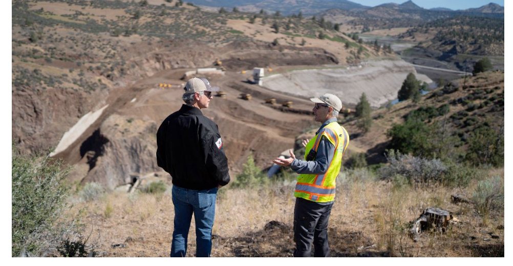
Governor Newsom at Klamath River dam removal project in Siskiyou County this week

The Klamath was once the third-largest salmon producing river on the West Coast before the construction of concrete dams beginning in